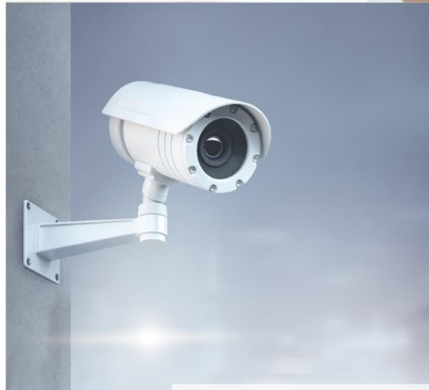
24x7 CCTV Surveillance