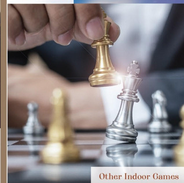
Other Indoor Games