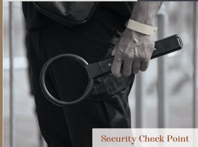
Security Check Point

Live a life encapsulated within a cocoon of utmost safety. Archid Harmony is a gated project, with security check-points and CCTV surveillance that keep the premises safe at all times. The well-designed wide roads, paved walkways and children play areas within the project ensure uninterrupted good times!