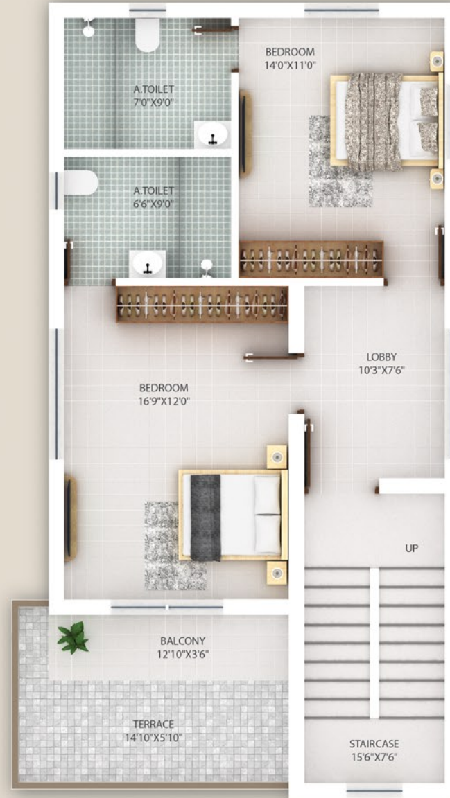
Total sqft BUA Of A Type- 2014 sqft