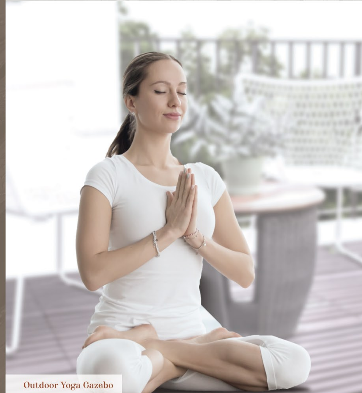
Outdoor Yoga Gazebo

Rejuvenate your body, mind and soul effortlessly at Archid Harmony! Within the project premises, you'll find a host of lifestyle amenities like a yoga gazebo, sports courts, senior citizen sitting areas, party lawn and much more, that ensure a wholesome living experience at all times!