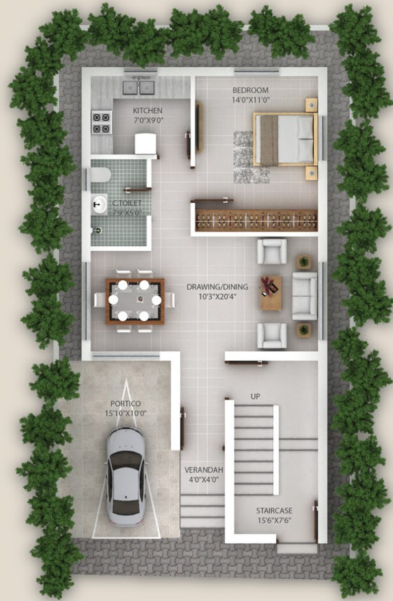
TYPE - A Ground 1BHK BUA - 931 sqft