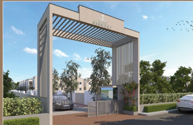
Entrance Filled With Green