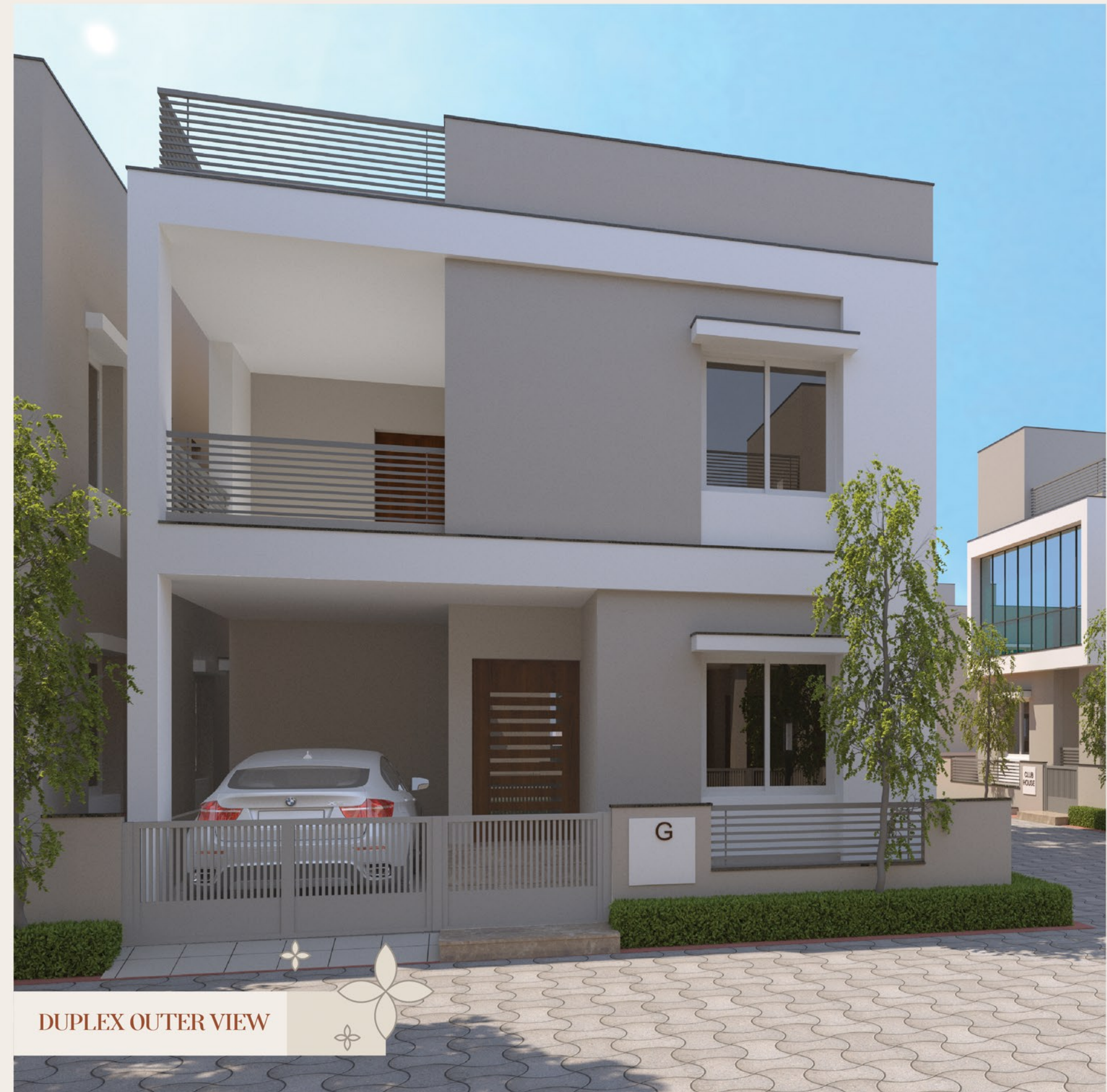
DUPLEX OUTER VIEW

Premium matt finish vitrified tiles 2'X2' with matching skirting.