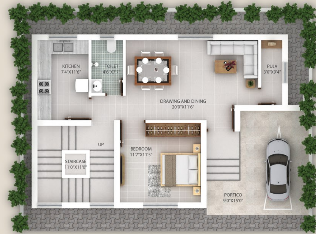
TYPE - D Ground 1BHK BUA - 976 sqft