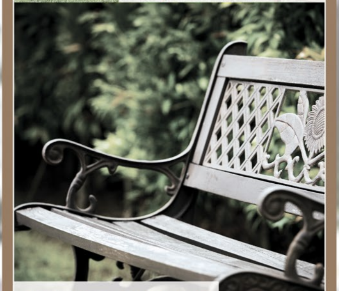
Senior Citizen Sitout Area