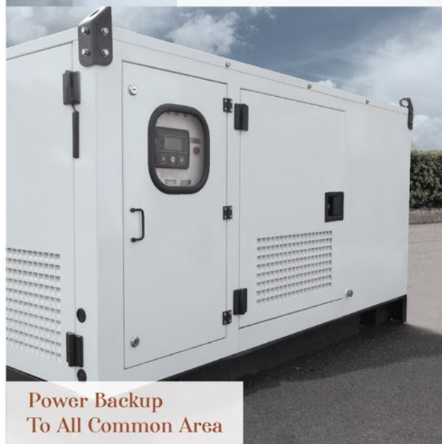
Power Backup To All Common Area