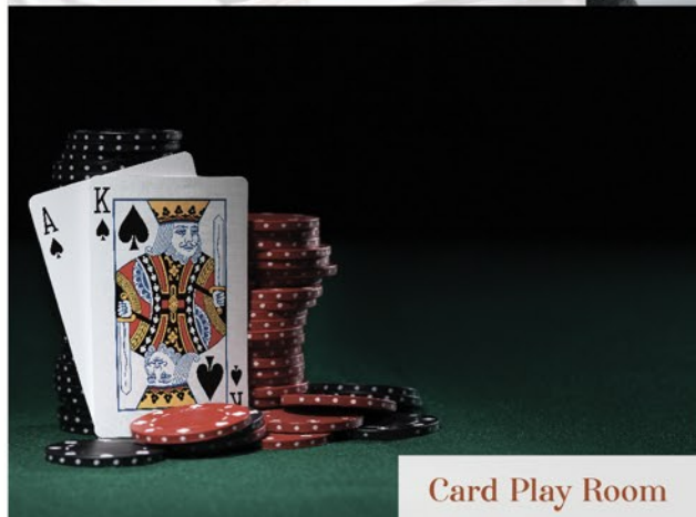
Card Play Room