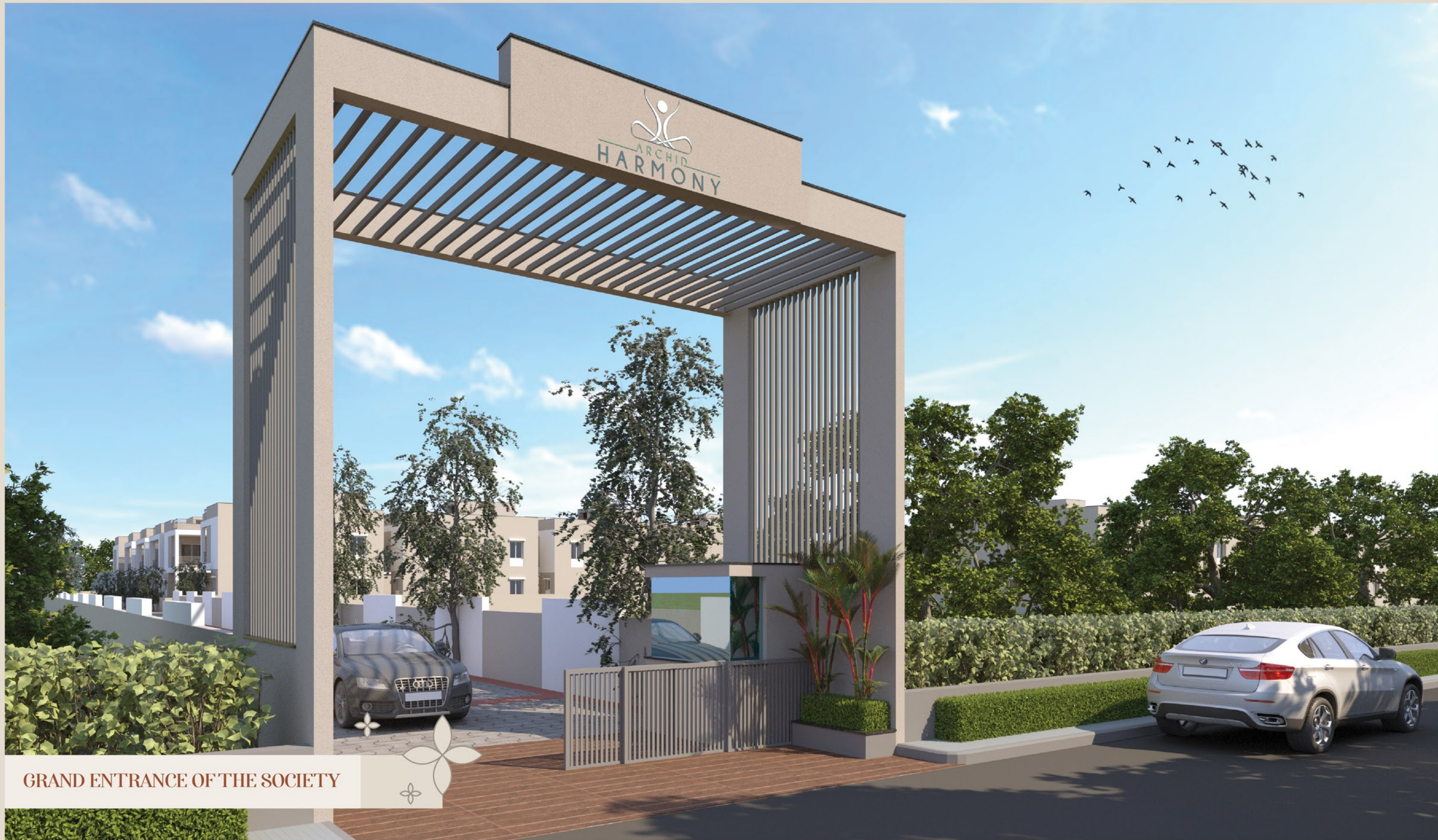
GRAND ENTRANCE OF THE SOCIETY