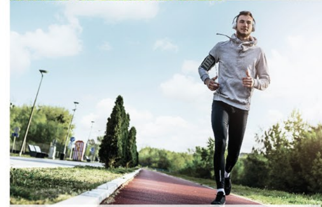
Internal Paved Pathway/walking Track