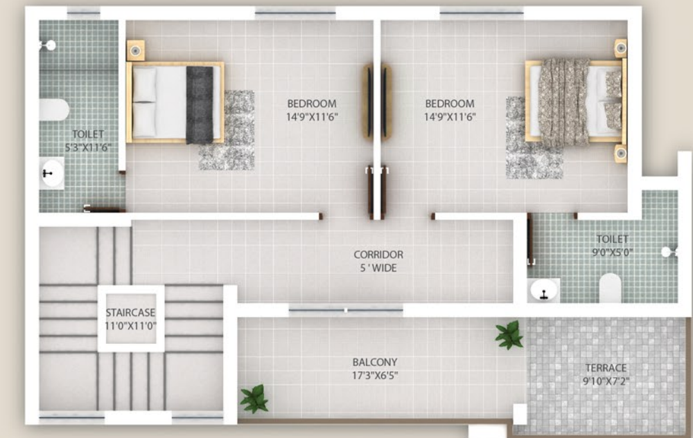
Total Sqft BUA Of D Type - 2110 sqft