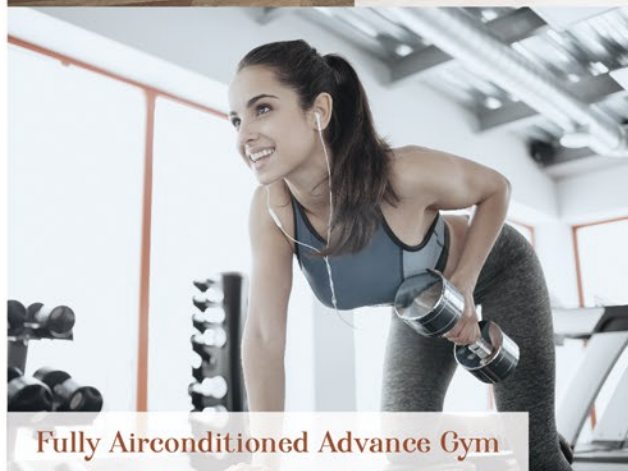
Fully Airconditioned Advance Gym