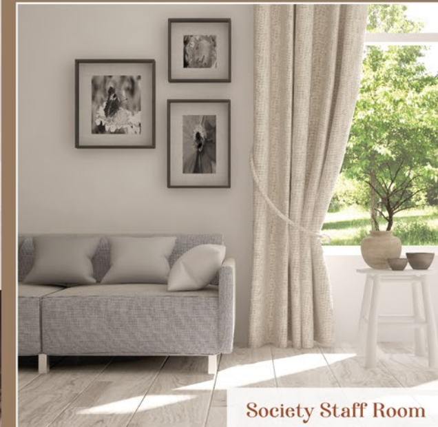
Society Staff Room