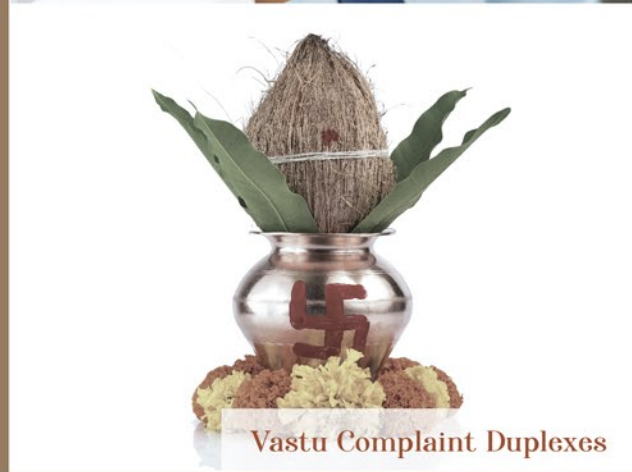
Vastu Complaint Duplexes