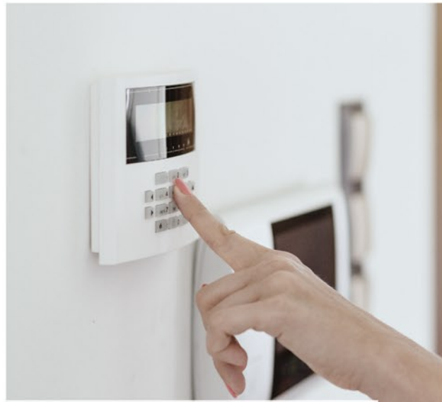
Intercom Facilities To All Duplexes