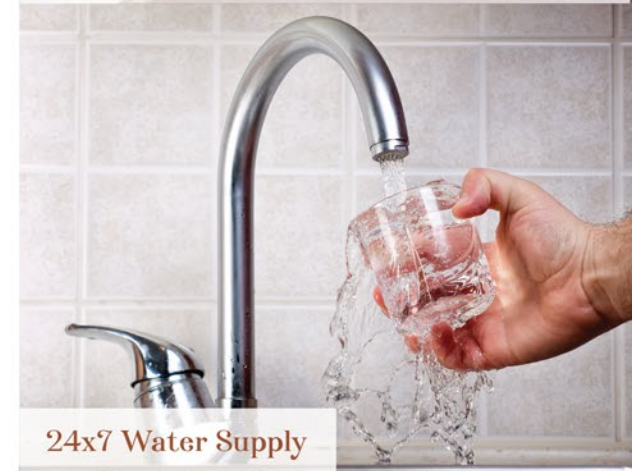
24x7 Water Supply