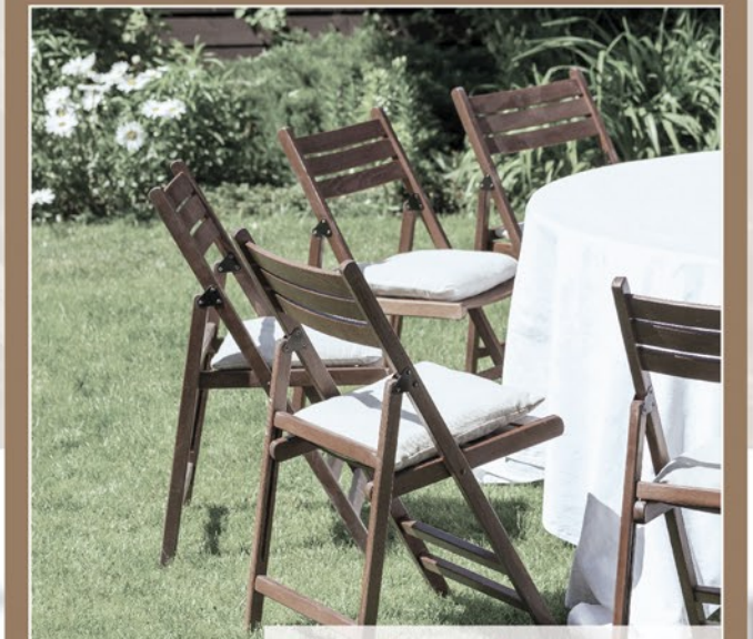
Party Lawn / Sitout Lawn